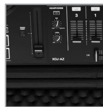
Skillfully molded to fit the AlphaTheta XDJ-AZ