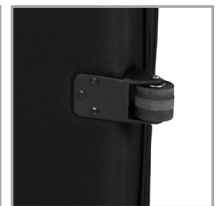
Heavy duty wheels for easy transport