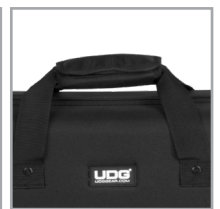
Convenient carry handle