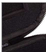
Durashock molded EVA foam