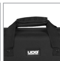
Heavy duty handle