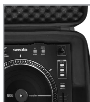
Skillfully molded to fit the Rane System One