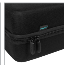
Easy grip zipper pulls