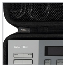
Skillfully moulded to fit AlphaTheta Slab