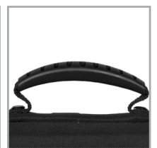
Convenient carry handle