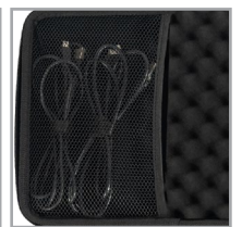
Spacious mesh pocket for cables