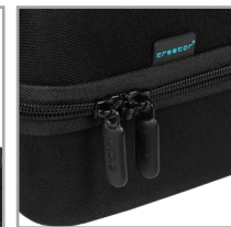
Easy grip zipper pulls