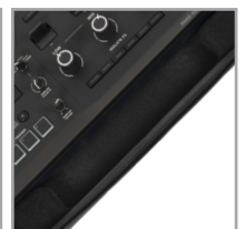
Extra cable storage