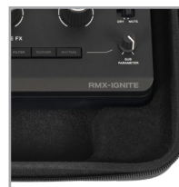
Fits AlphaTheta RMX-Ignite