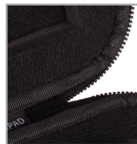
Durashock molded EVA foam