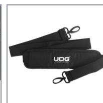
Convenient shoulder strap