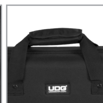
Heavy duty handle