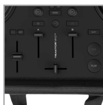
Skillfully molded to fit the NI Traktor MX2