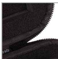
Durashock molded EVA foam