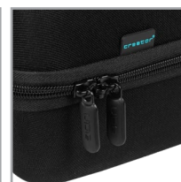
Easy grip zipper pulls