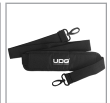
Convenient shoulder strap