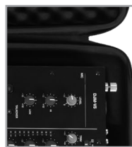
Skillfully moulded to fit AlphaTheta DJM-V5