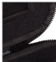
Durashock molded EVA foam