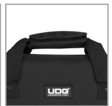
Heavy duty handle