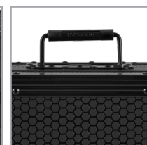
UDG heavy-duty spring-loaded handles