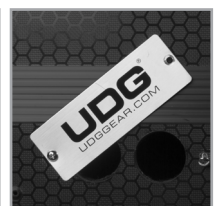
Cable access hole with removable UDG emblem cover