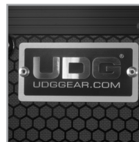
High grade aluminium UDG logo plate