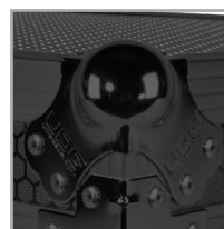
Secure stacking due to stackable ball corners