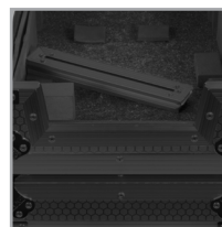
Removable front access panel