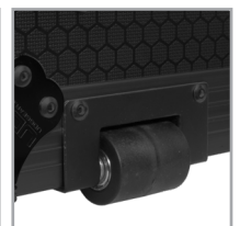
Roller wheels with high quality in-line skate bearings