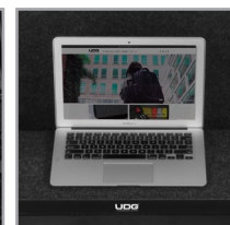
Adjustable laptop shelf