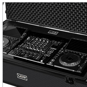
DJ Podium + Flight Case packed together