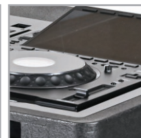
Allows compatible equipment to be mounted in a recessed configuration