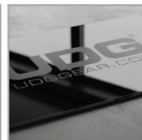
Solid black acrylic construction with a glossy premium finish